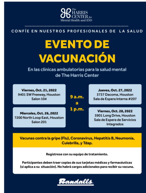
Vaccine Flier in Spanish